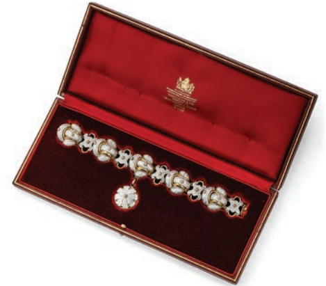
Aluminum and gold curb link bracelet. French, ca. 1840. L: 7 in. (later fitted case)

For a brief period, aluminum was the “it” metal of the nineteenth century. Although it was discovered in the early 1800s, the general public first encountered this novel metal at the 1855 Paris World Exposition, where it sparked widespread curiosity. That same year, Napoleon III showcased aluminum’s prestige by using it for state dinner tableware reserved for his most honored guests, while others dined with silver. Due to a challenging extraction process, aluminum was initially rarer and more expensive than gold. However, a patented extraction method in 1858 made aluminum more affordable and accessible. At the 1867 Paris Exposition, aluminum sheets, foil, wire, and jewelry were prominently displayed, further cementing its popularity and appeal.