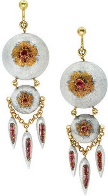
Aluminum and gold drop earrings set with rubies. French, ca. 1860. (later post fittings). L: 3 in.