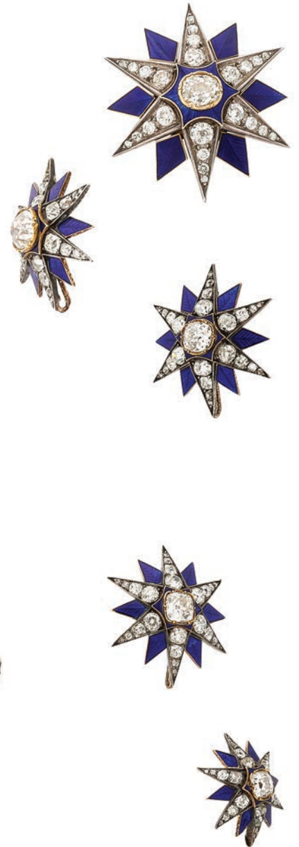
Blue enamel and diamond star tiara, mounted in silver and gold. With brooch fittings for each of the stars. English, ca. 1870.