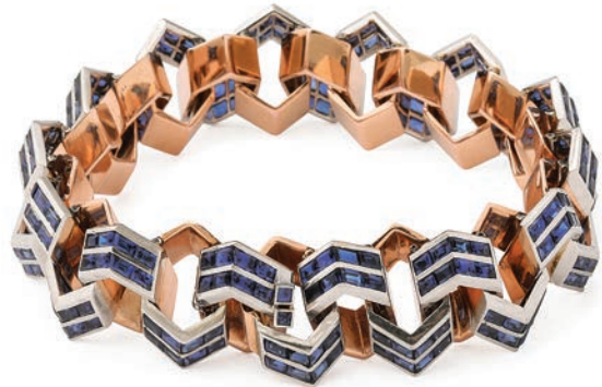
Sapphire geometric bracelet set in platinum and gold. Paul Flato , American, ca. 1930. L: 7-1/2 in.