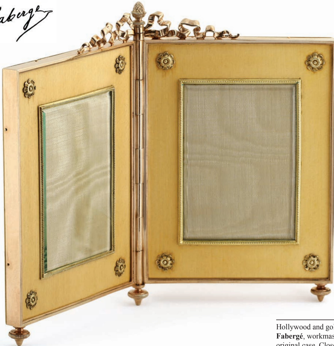
Hollywood and gold double folding frame. Fabergé , workmaster A. Nevalainen, St. Petersburg, ca. 1900. With original case. Closed: 5-1/2 x 3-9/16 in., Open: 5-1/2 x 6-15/16 in.