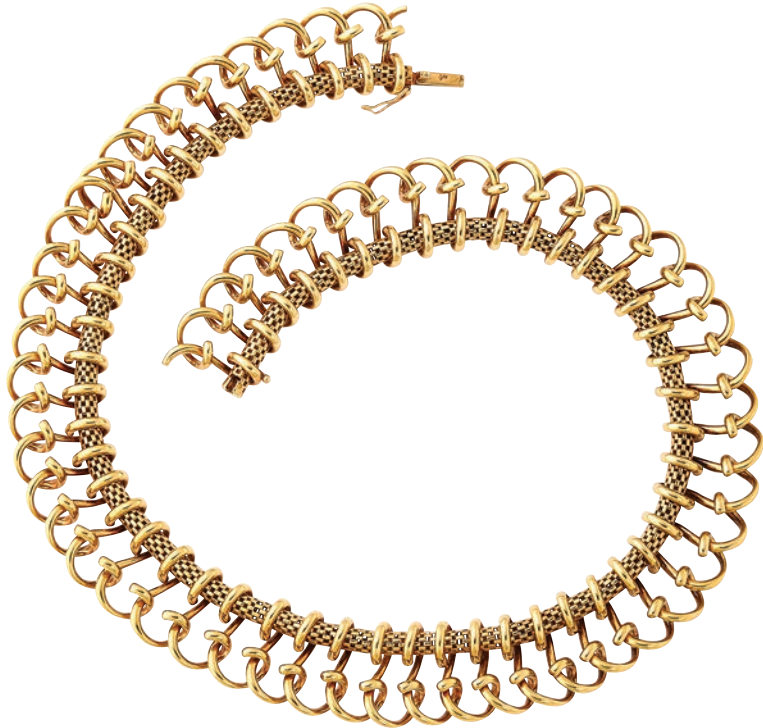
Mid-century 18k gold wirework scroll collar necklace designed as a tubular chain. French, ca. 1950. L: 15-1/2 in.