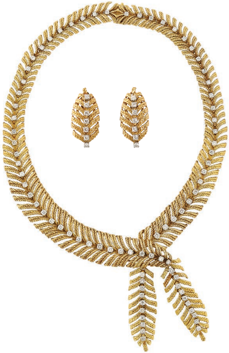
18k gold swag necklace and matching earrings set with diamonds in platinum. Boucheron , Paris, ca. 1950. L: 15-3/4 in.