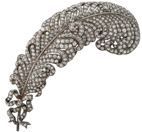
Diamond feather brooch set in silver and gold. English, ca. 1880. L: 2-3/4 in.