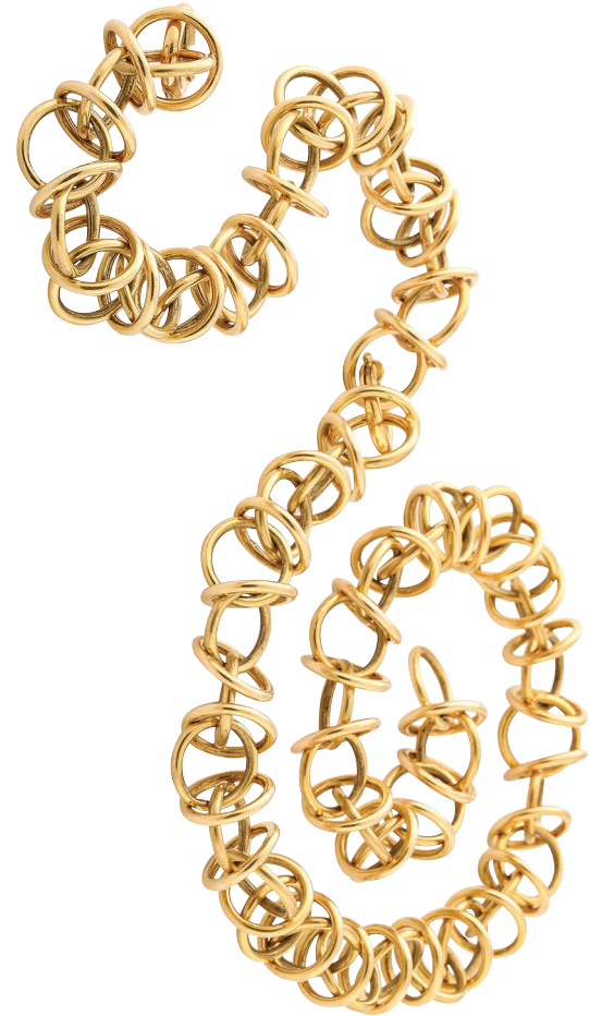
18k gold necklace of alternating circles. Can be worn as a bracelet and shorter necklace. Paloma Picasso for Tiffany & Co. , ca. 1975. L: 24 in.