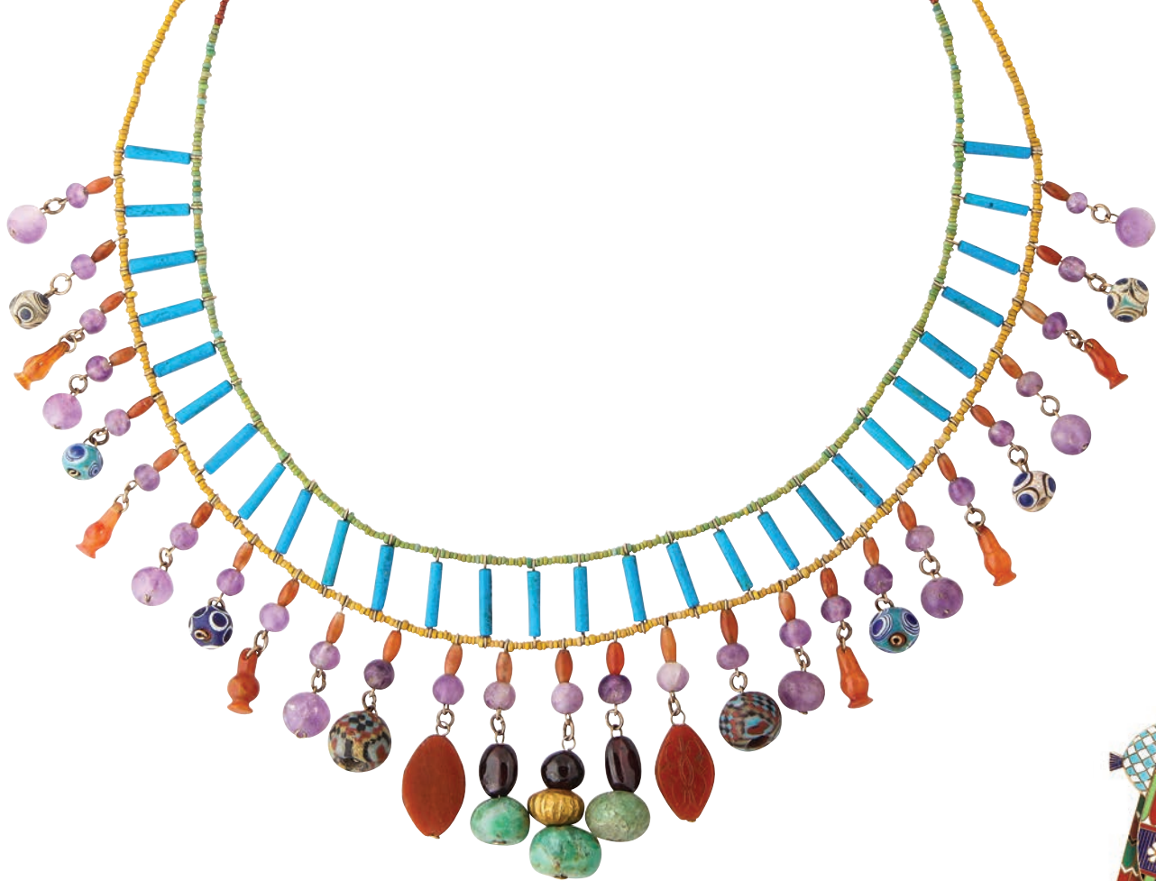
Egyptian Revival faience and hardstone necklace, strung on wire with gold fittings. Ca. 1870. D: 4-1/2 in.

Provenance: Retailled by A La Vieille Russie, ca. 1950.