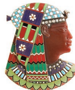
— Egyptian Revival gold and multi-colored enamel brooch of a Pharaoh’s profile with a carved carnelian face. English, ca. 1890. L: 1-1/2 in.