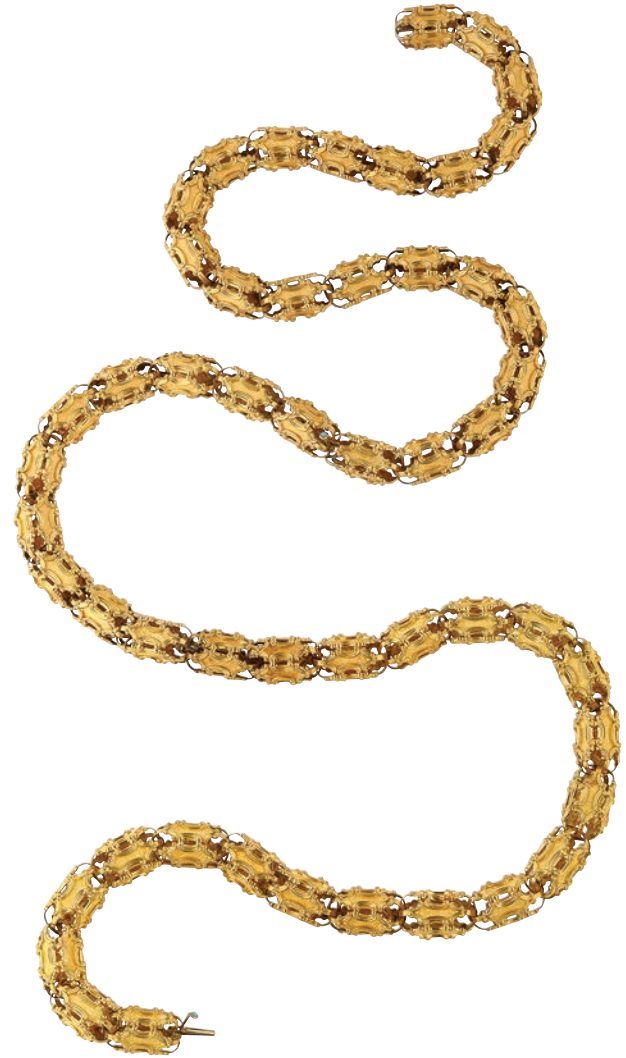
18k long gold chain, each link made of five framed panels with scroll borders. Converts into a pair of necklaces and a bracelet. English, ca. 1830. L: 43 in.