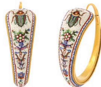
— Micromosaic hoop earrings decorated with beetles and trailing flowers, set in gold. Ca. 1840, possibly Italian. L: 1-1/2 in.

This design takes inspiration from Egyptian “wesekh” style necklaces, a term meaning “the broad one.” The necklace shape was inspired by ancient floral collars.