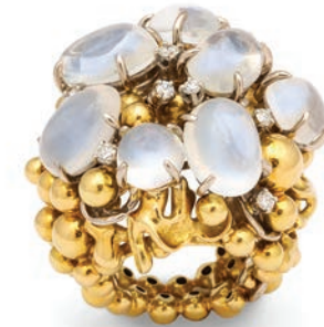
— Pavé brilliant-cut diamond ring set with cabochon onyx, in 18k white gold. Cartier , French, ca. 1980. — Bombé cluster ring set with seven moonstones and ten diamonds in a gold ball mount. English, ca. 1960.