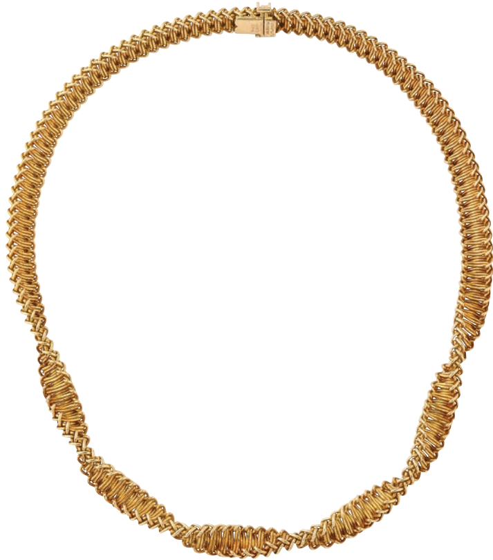
48 18k gold twist necklace. Cartier , Paris, ca. 1950. L: 15-3/4 in.