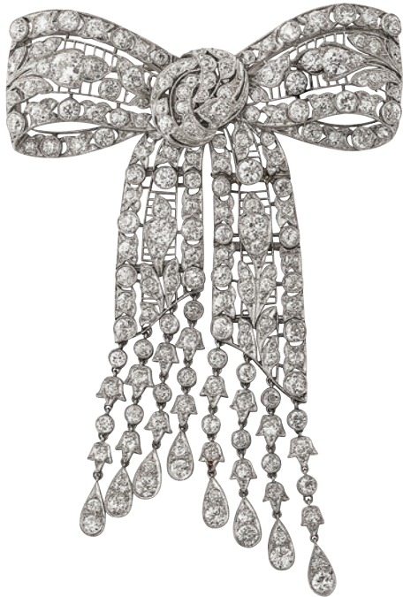
Belle Epoque articulated diamond bow brooch set in platinum. English, ca. 1905. L: 3-1/2 in.