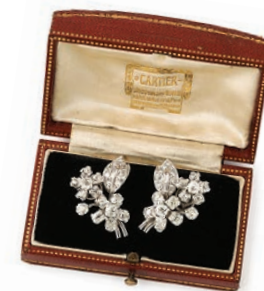
— Gold wirework and diamond scroll earrings.

Cartier , Paris, ca. 1960. L: 1-1/16 in. (approx. 1.25 cts. of diamonds in total)