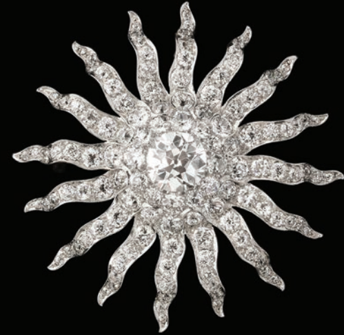
Diamond sunburst brooch/pendant set in platinum and gold centering an old European-cut diamond weighing approx. 6.25 cts.; the balance, old European- and old mine-cut diamonds totaling approx. 15 cts. Howard & Co. , New York, ca. 1905. D: 2-1/2 in. Original case and later hair fitting.