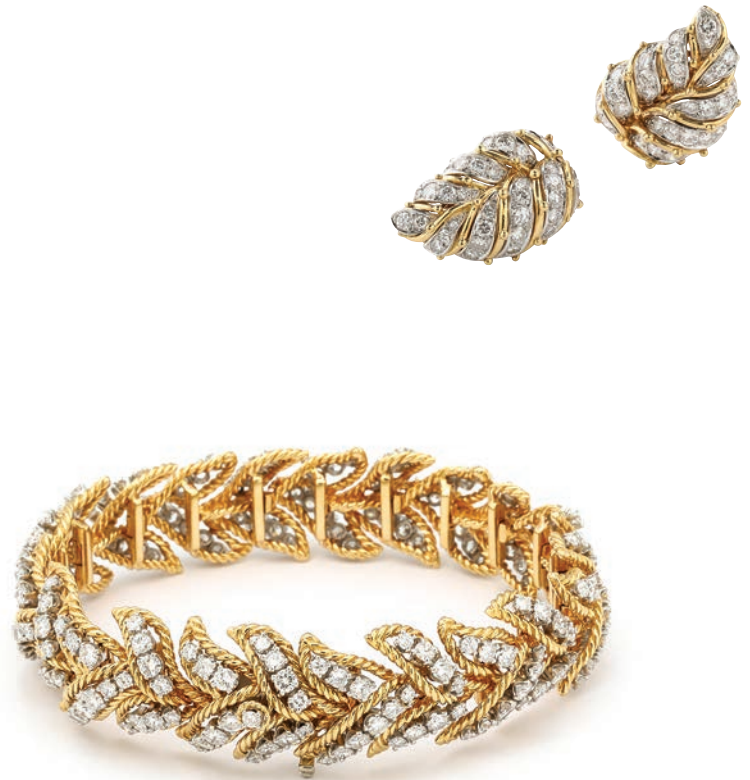
18k gold and platinum brilliant-cut diamond bracelet and earrings. Cartier , New York, ca. 1950. Bracelet L: 7-3/8 in. (approx. 10 cts.) Earrings L: 1 in. (approx. 5.50 cts.)