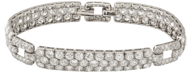
Diamond and platinum chain necklace, which can also be worn as two matching bracelets. Mauboussin , Paris, 1928. Necklace length: 15 in.