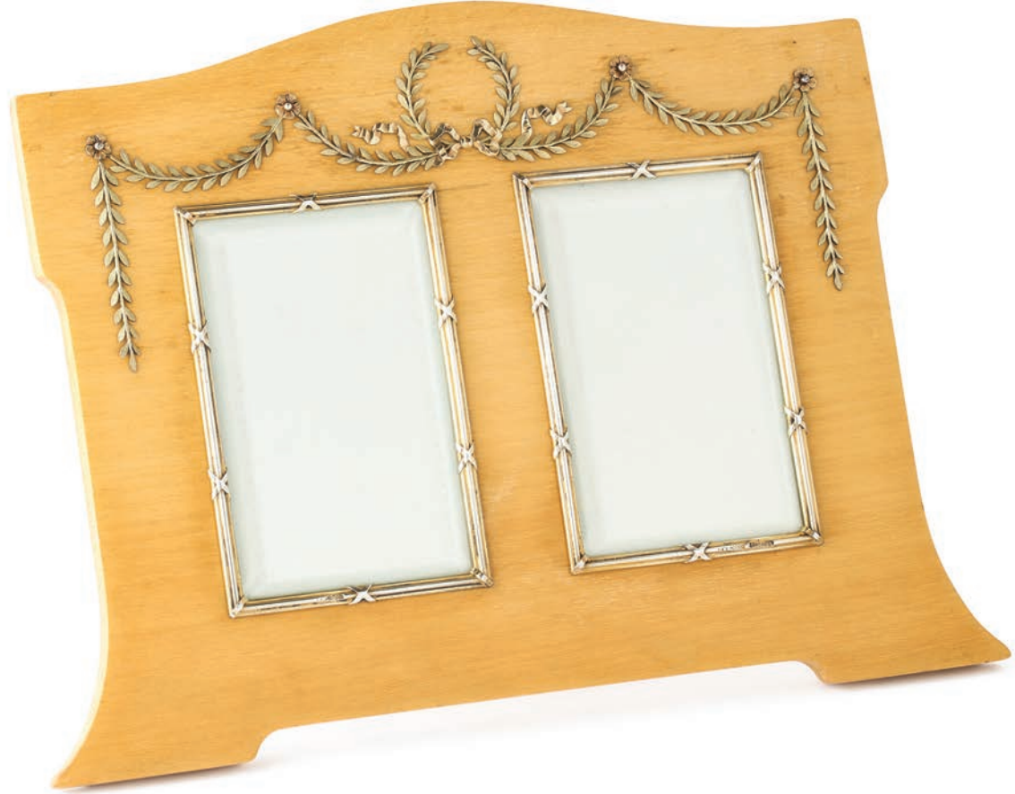
42 Hollywood and gilded silver double photo frame, with wood strut. Fabergé , workmaster V. Aarne, St. Petersburg, ca. 1890. H: 5-1/4 in.