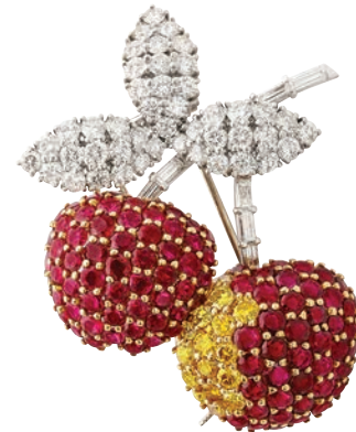
Ruby, diamond, and yellow diamond cherry brooch set in platinum and gold. Raymond Yard , American, ca. 1950. L: 2 in.