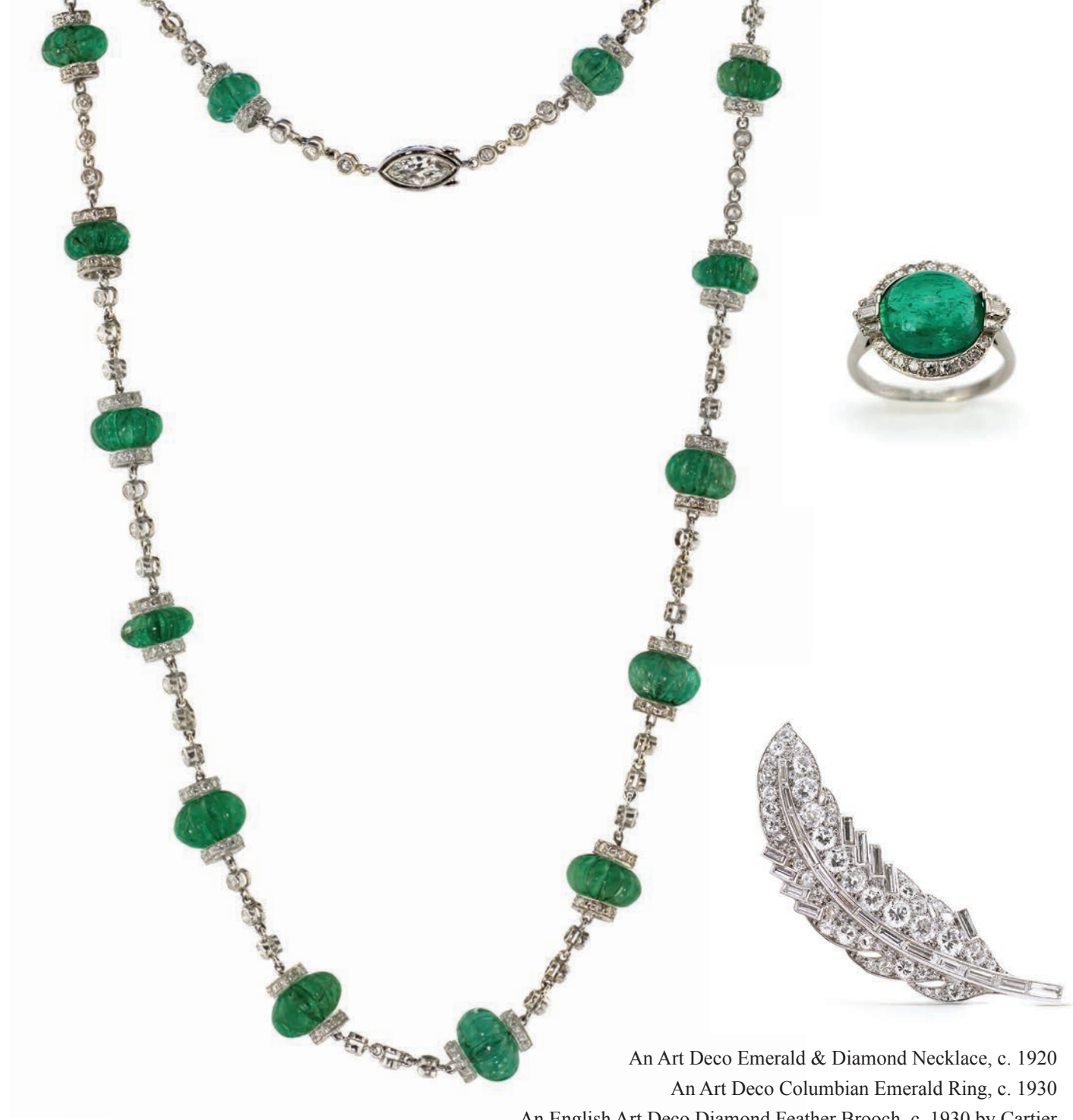
An Art Deco Emerald & Diamond Necklace, c. 1920