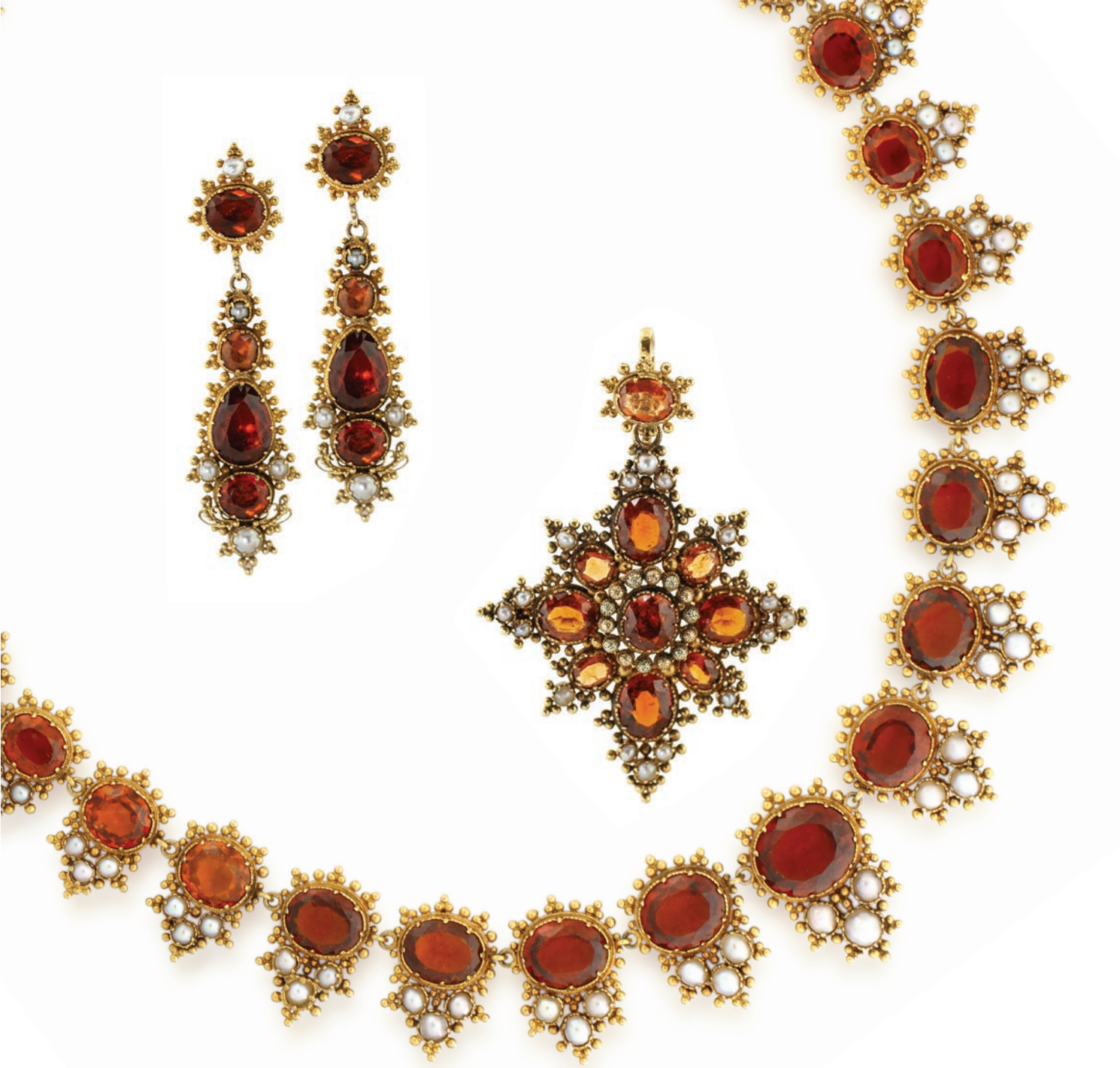
A Hessonite Garnet & Pearl Necklace & Earrings, c. 1840