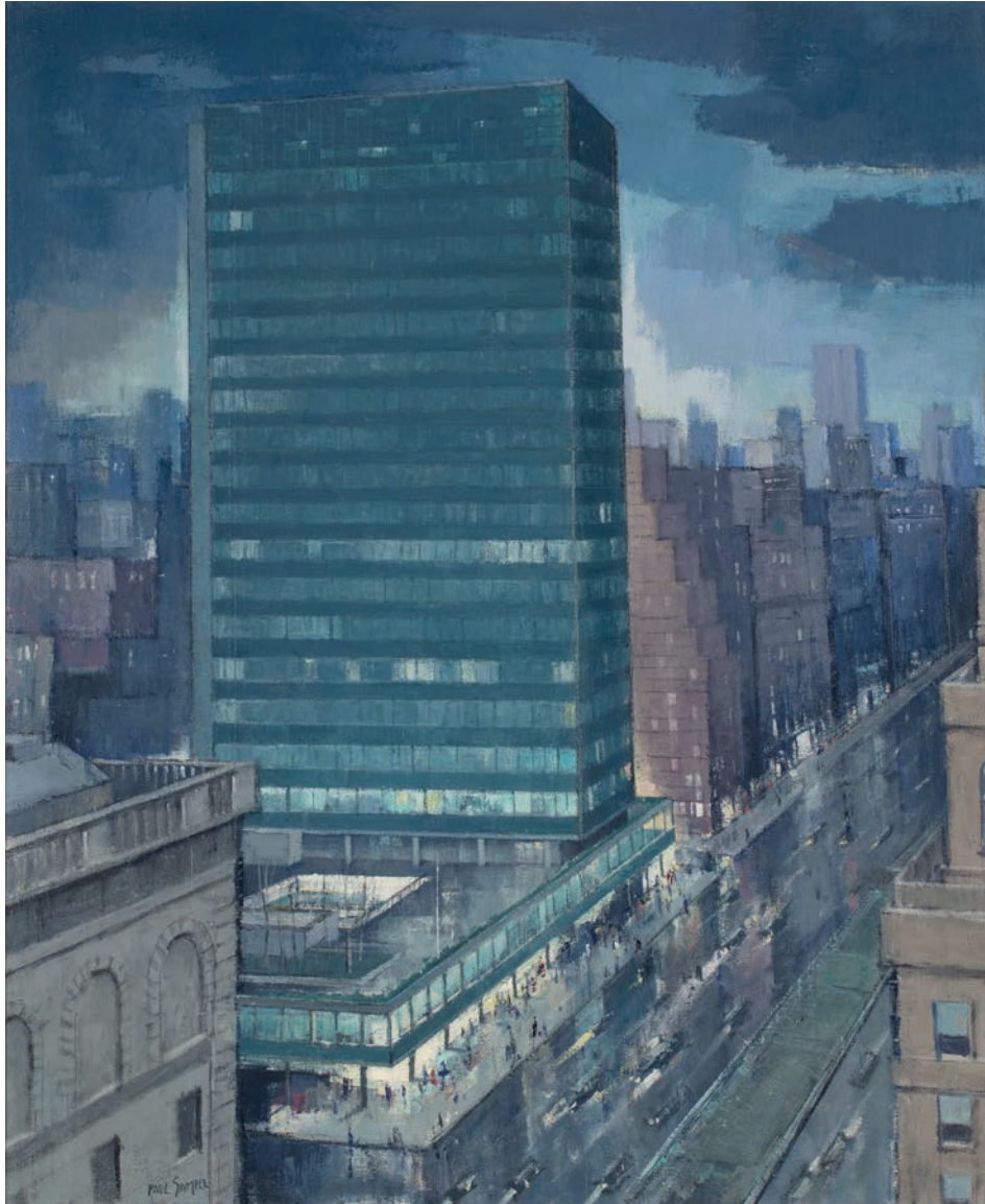
Lever House, New York, c. 1952 by Paul Sample, 35-1/2" x 29-1/4"