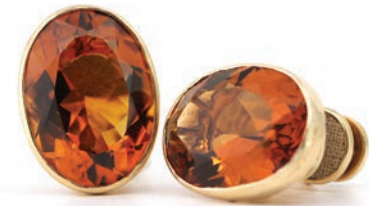
A Pair of French Citrine Earrings, c. 1950 by Marchak