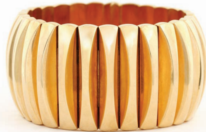
An Italian Gold Bracelet, c. 1960 by Proto Oreficeria Vicentina