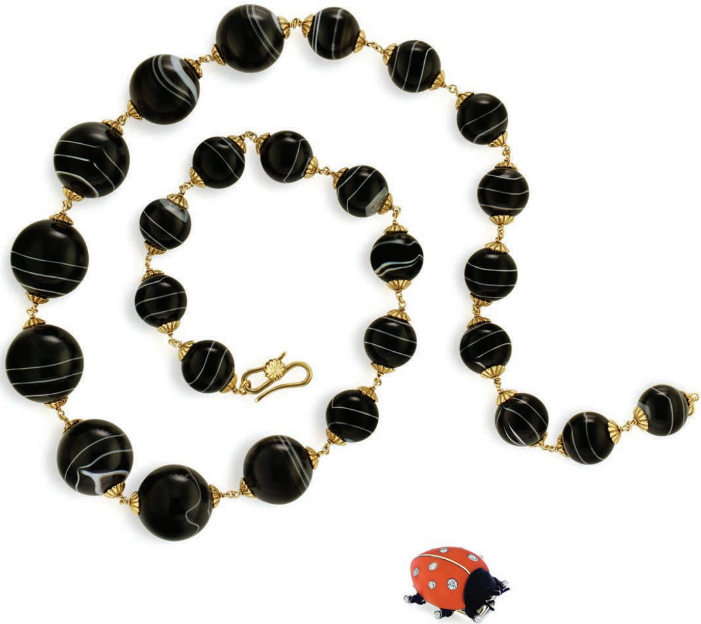
An Agate & Gold Necklace, c. 1870