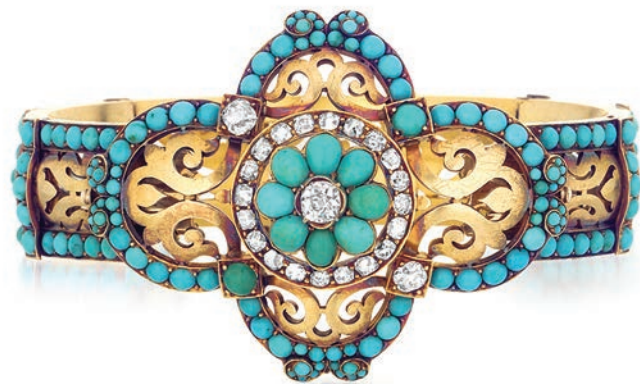
A French Turquoise, Pearl & Diamond Bracelet, c. 1870