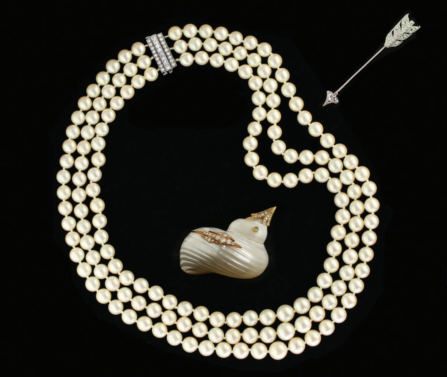
A French Diamond Jabot Arrow Brooch, c. 1915 by Cartier